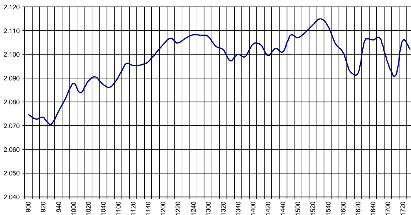
Valor medio del índice IBEX Growth Market 15 cada 10' (Index Average every 10')