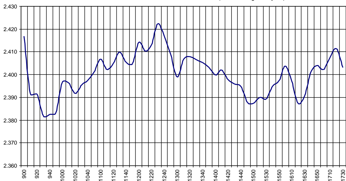
Valor medio del índice IBEX Growth Market 15 cada 10' (Index Average every 10')