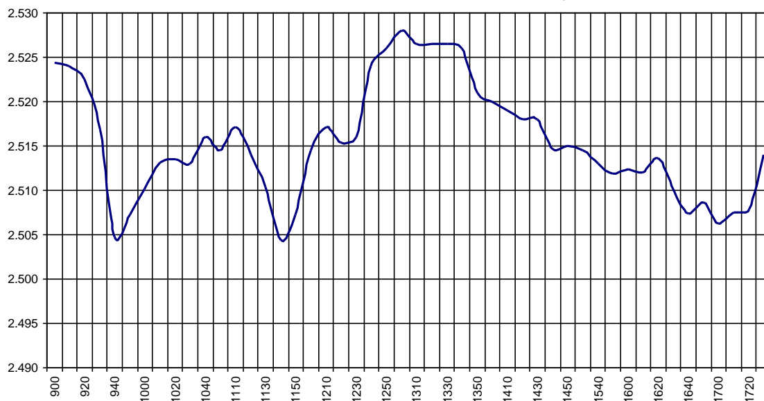
Valor medio del índice IBEX Growth Market 15 cada 10' (Index Average every 10')