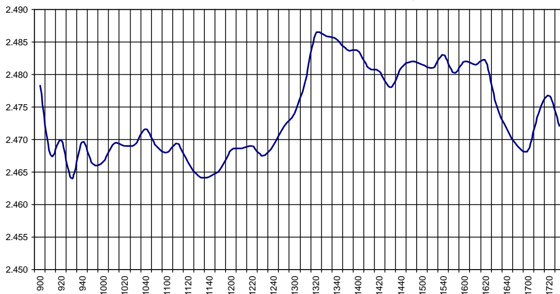
Valor medio del índice IBEX Growth Market 15 cada 10' (Index Average every 10')