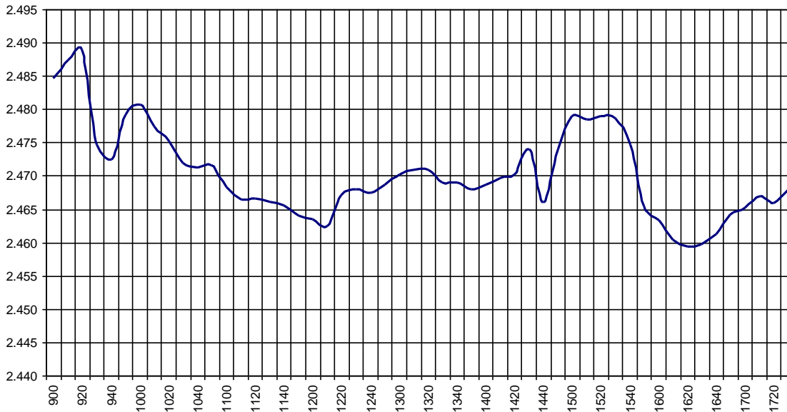
Valor medio del índice IBEX Growth Market 15 cada 10' (Index Average every 10')