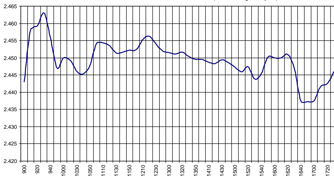
Valor medio del índice IBEX Growth Market 15 cada 10' (Index Average every 10')