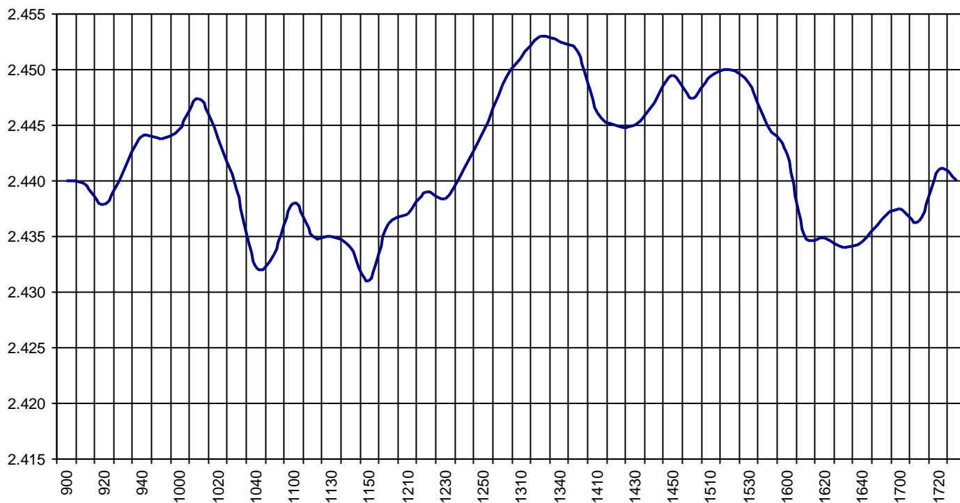
Valor medio del índice IBEX Growth Market 15 cada 10' (Index Average every 10')