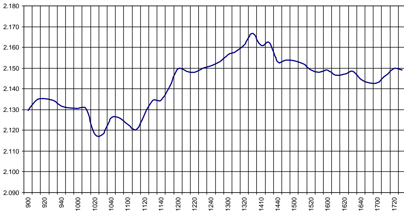
Valor medio del índice IBEX Growth Market 15 cada 10' (Index Average every 10')