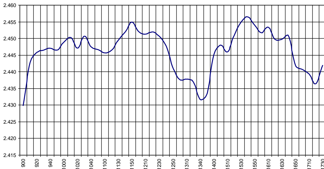
Valor medio del índice IBEX Growth Market 15 cada 10' (Index Average every 10')