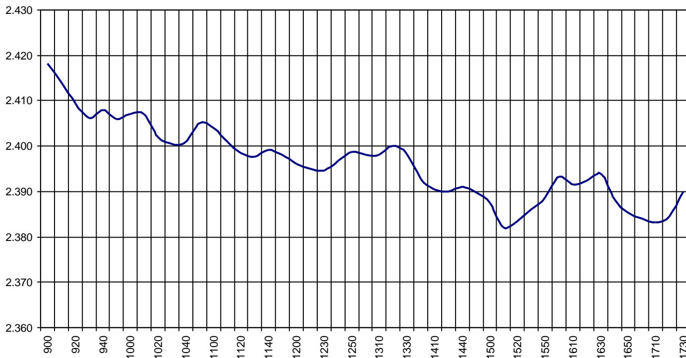
Valor medio del índice IBEX Growth Market 15 cada 10' (Index Average every 10')