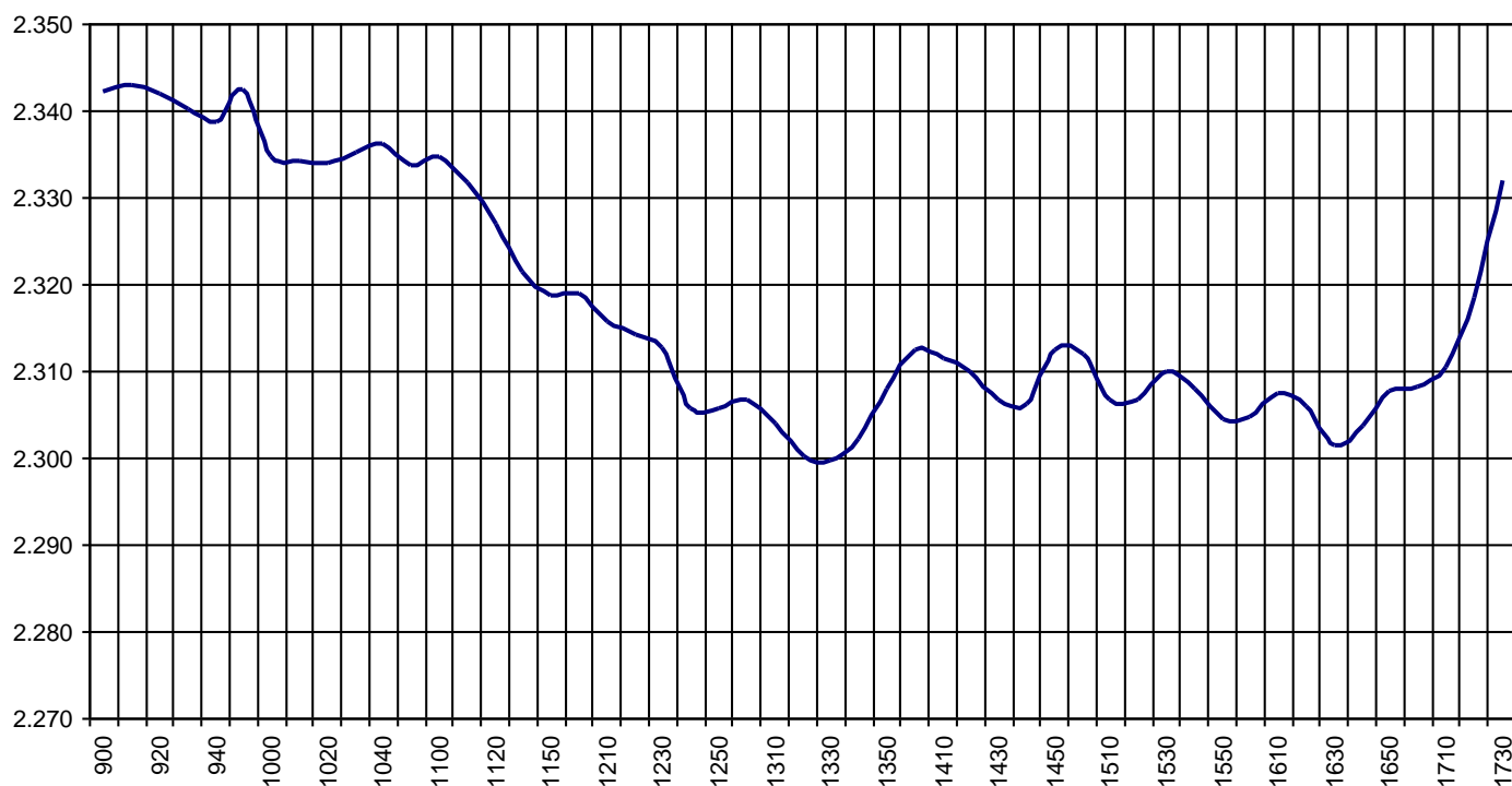
Valor medio del índice IBEX Growth Market 15 cada 10' (Index Average every 10')