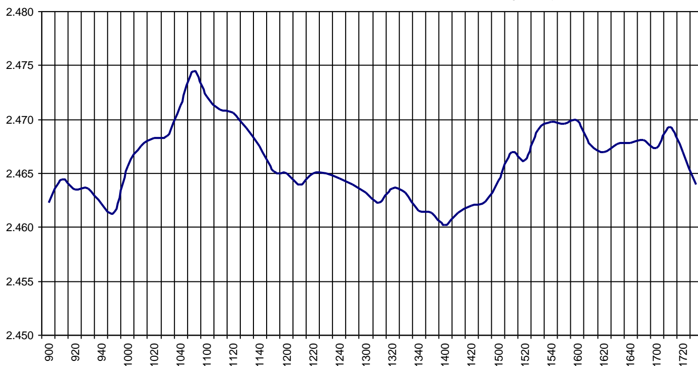
Valor medio del índice IBEX Growth Market 15 cada 10' (Index Average every 10')