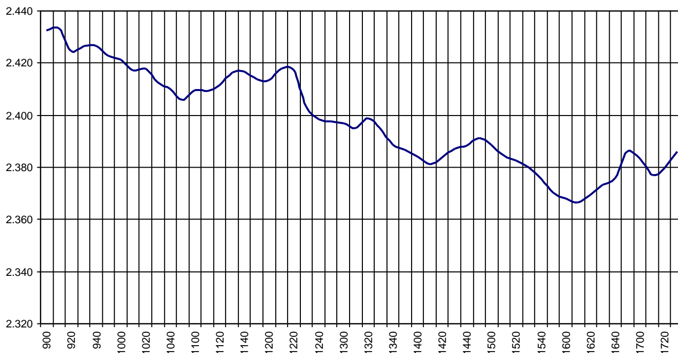
Valor medio del índice IBEX Growth Market 15 cada 10' (Index Average every 10')