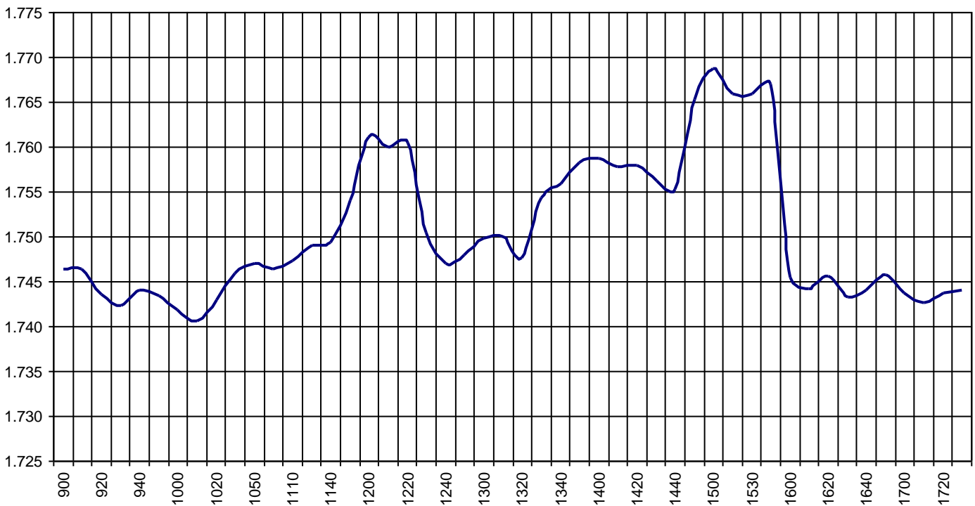
Valor medio del índice IBEX Growth Market 15 cada 10' (Index Average every 10')