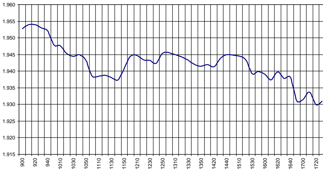
Valor medio del índice IBEX Growth Market All Share cada 10' (Index Average every 10')