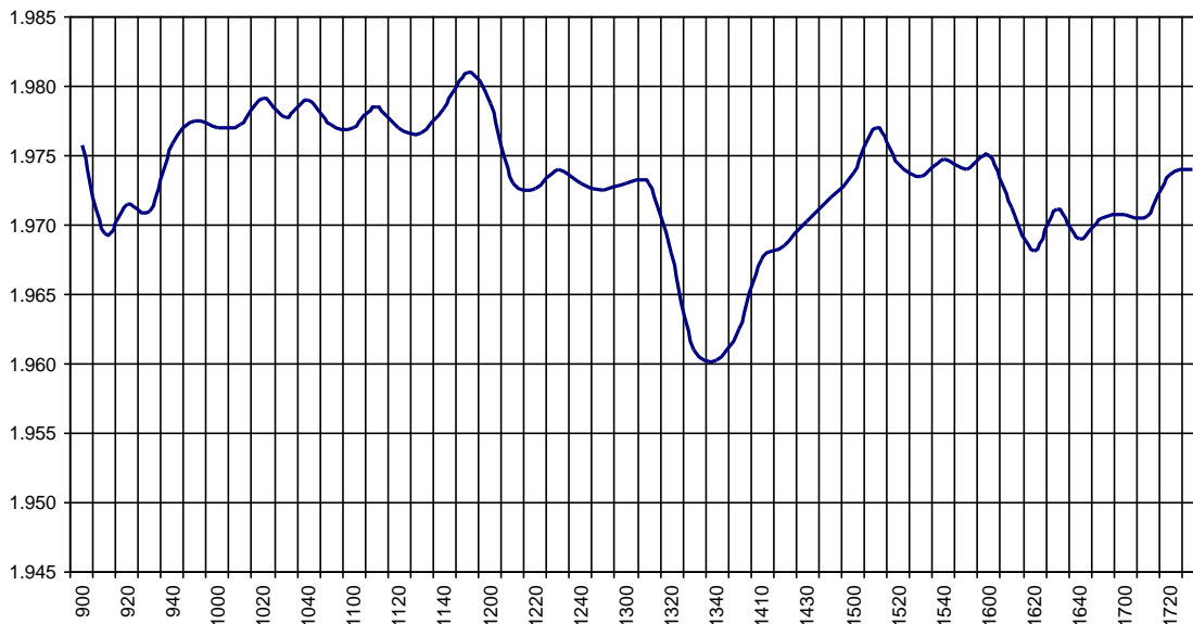
Valor medio del índice IBEX Growth Market All Share cada 10' (Index Average every 10')