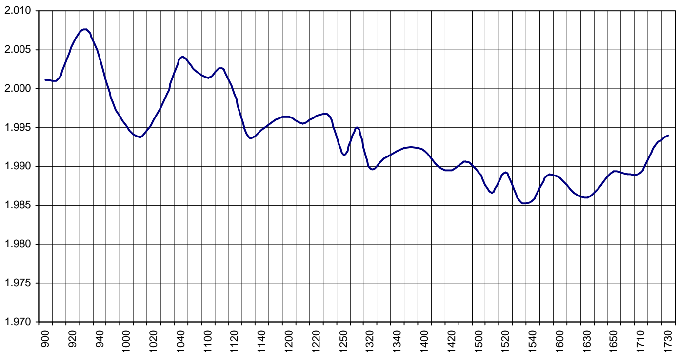
Valor medio del índice IBEX Growth Market All Share cada 10' (Index Average every 10')