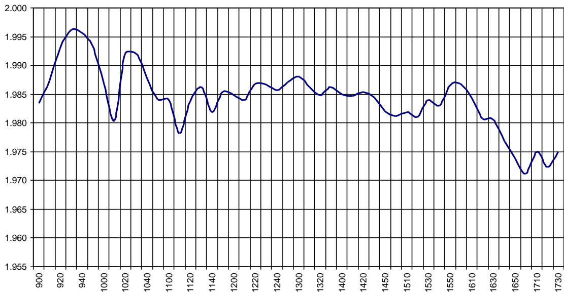
Valor medio del índice IBEX Growth Market All Share cada 10' (Index Average every 10')