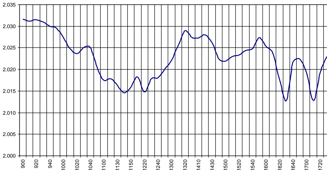
Valor medio del índice IBEX Growth Market All Share cada 10' (Index Average every 10')