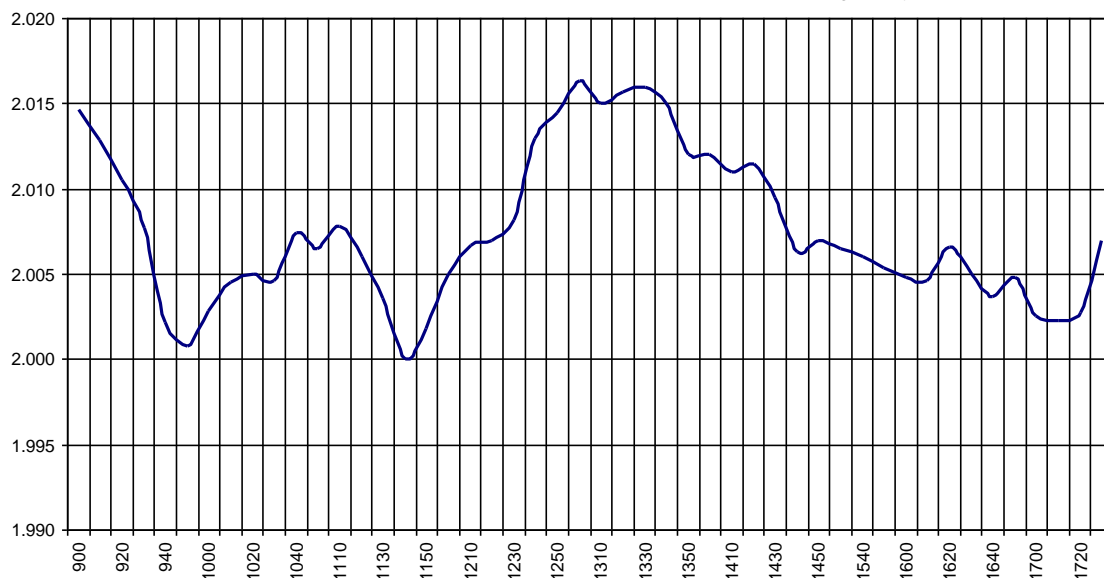
Valor medio del índice IBEX Growth Market All Share cada 10' (Index Average every 10')