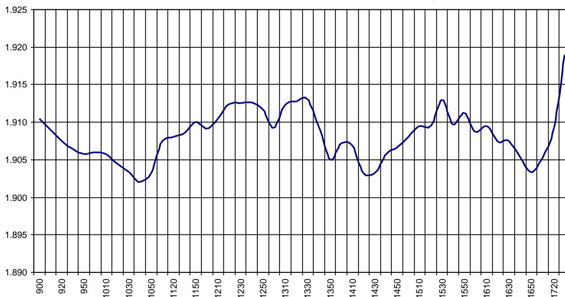
Valor medio del índice IBEX Growth Market All Share cada 10' (Index Average every 10')