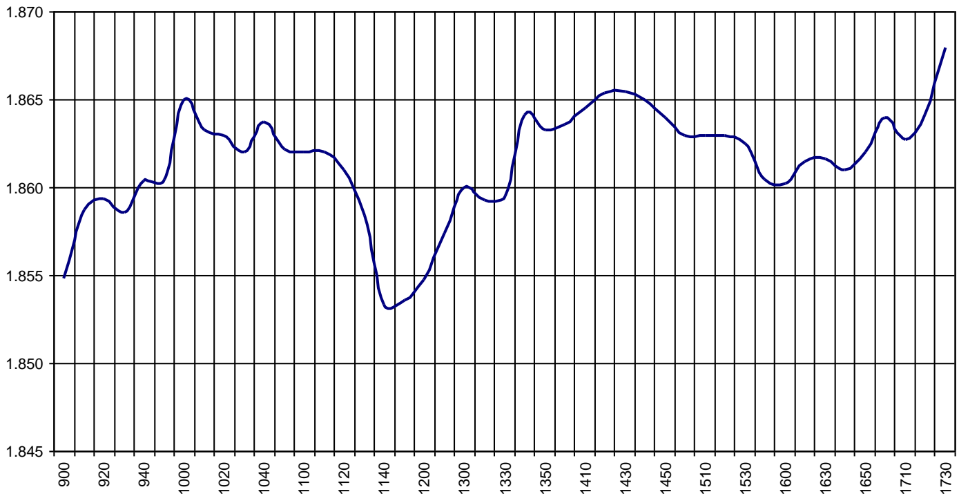
Valor medio del índice IBEX Growth Market All Share cada 10' (Index Average every 10')