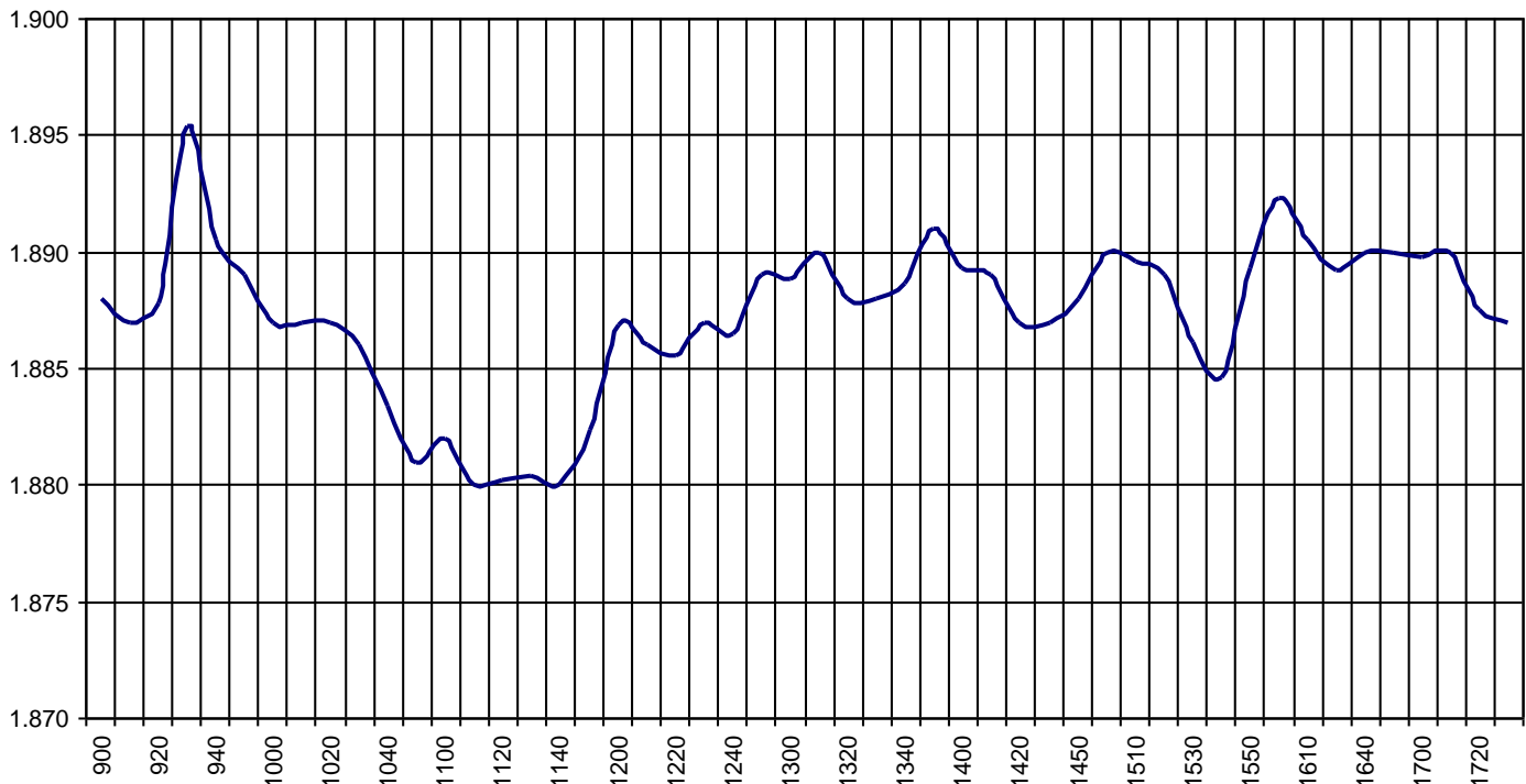
Valor medio del índice IBEX Growth Market All Share cada 10' (Index Average every 10')