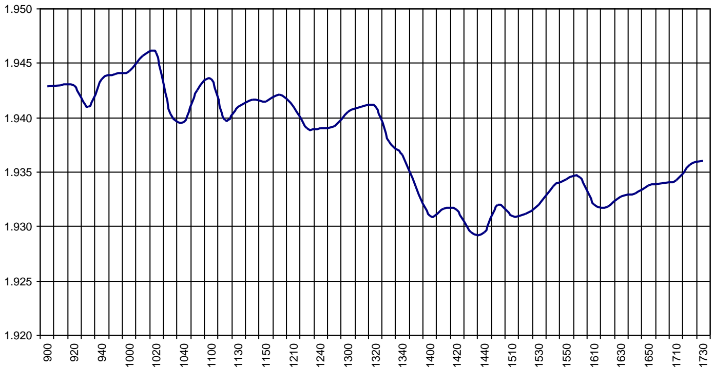
Valor medio del índice IBEX Growth Market All Share cada 10' (Index Average every 10')