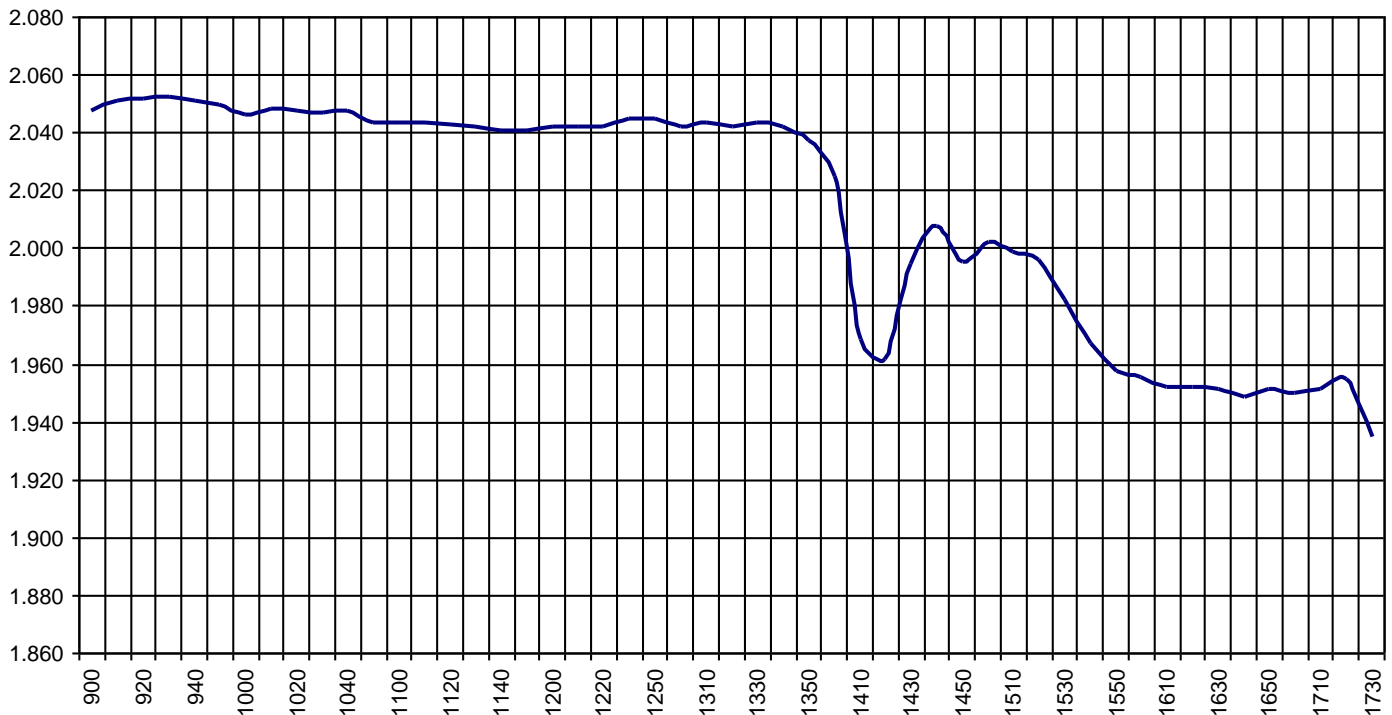
Valor medio del índice IBEX Growth Market All Share cada 10' (Index Average every 10')