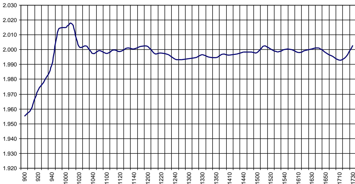
Valor medio del índice IBEX Growth Market All Share cada 10' (Index Average every 10')