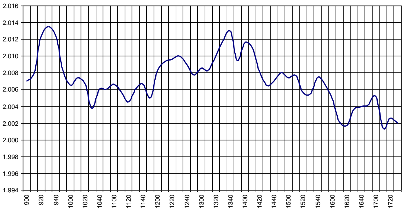
Valor medio del índice IBEX Growth Market All Share cada 10' (Index Average every 10')