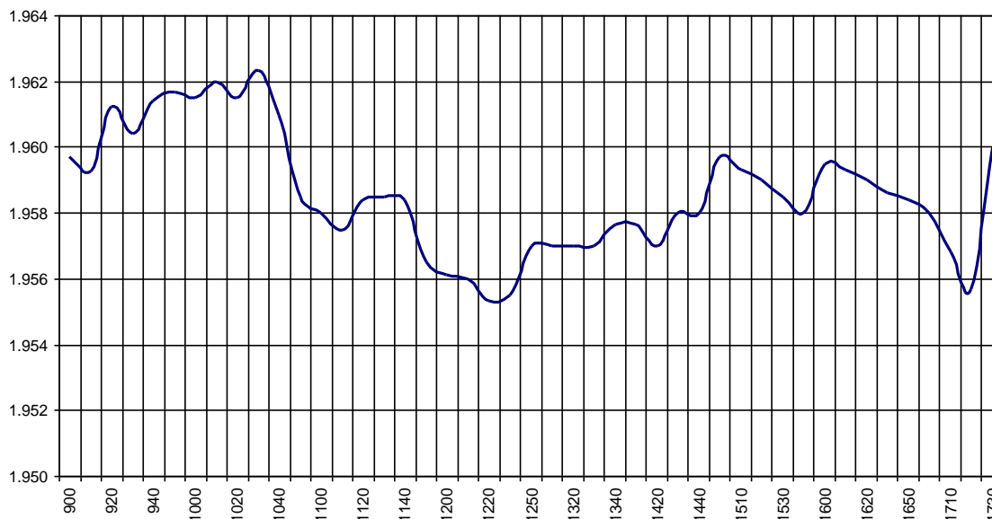
Valor medio del índice IBEX Growth Market All Share cada 10' (Index Average every 10')