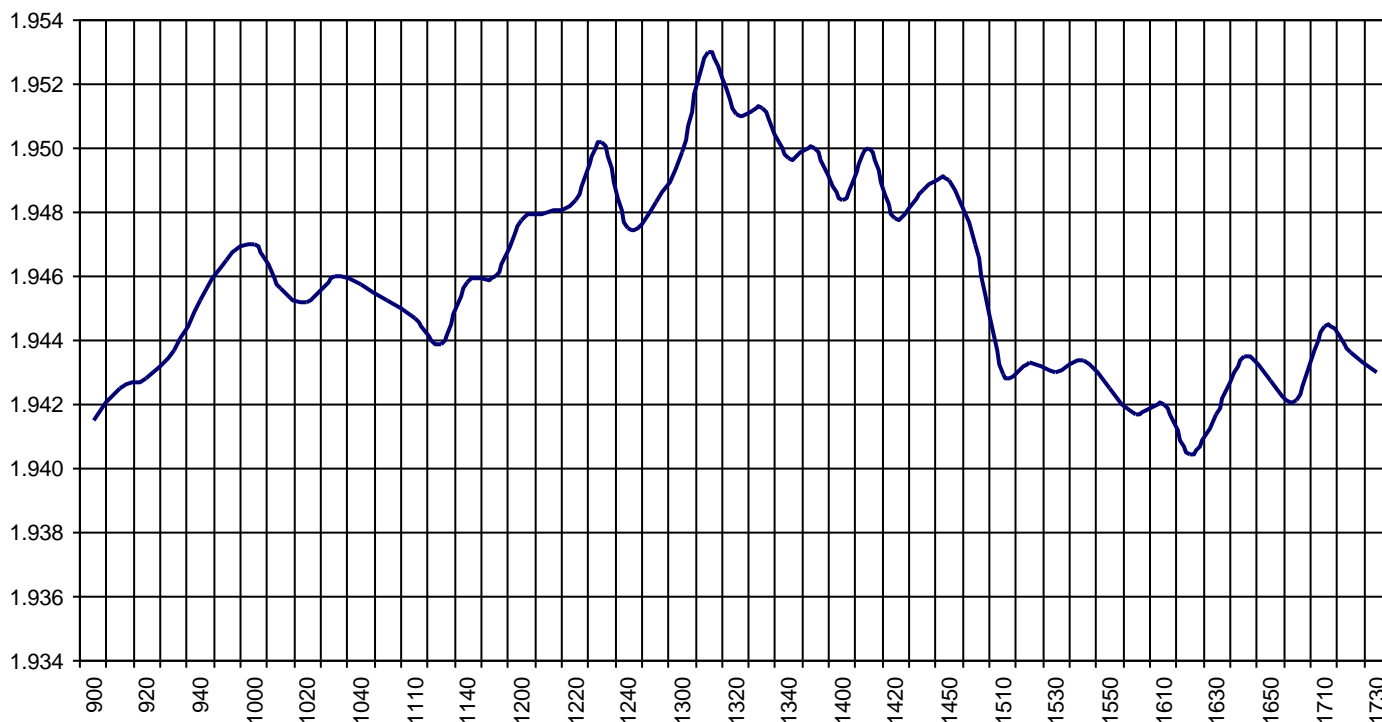
Valor medio del índice IBEX Growth Market All Share cada 10' (Index Average every 10')