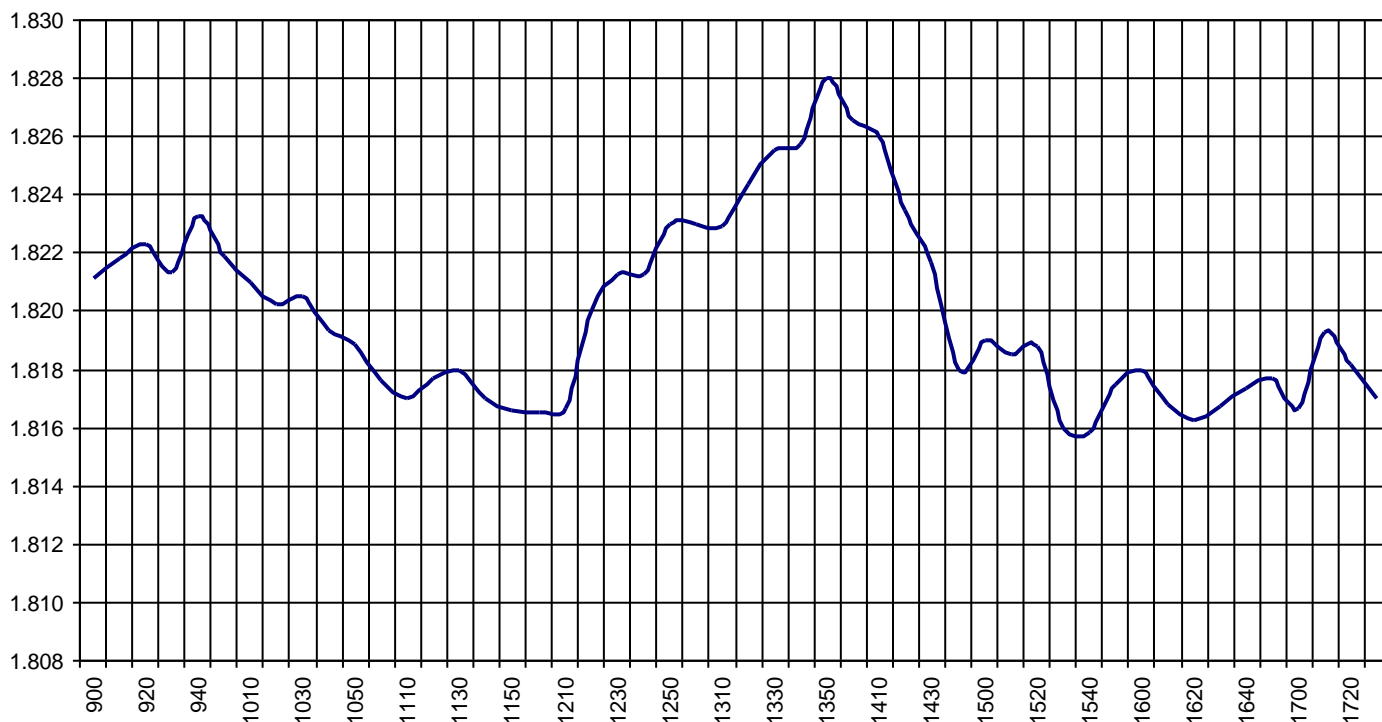
Valor medio del índice IBEX Growth Market All Share cada 10' (Index Average every 10')