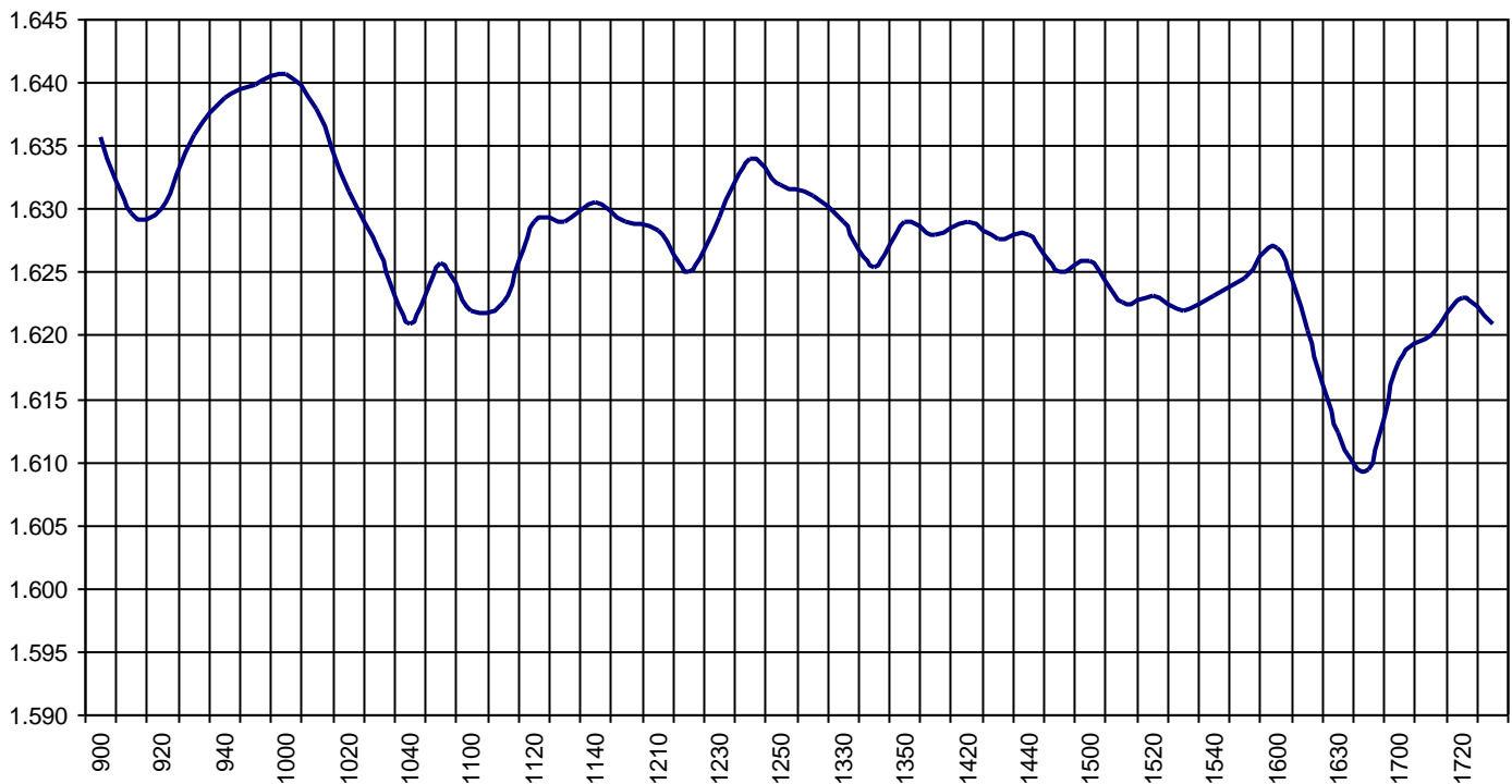
Valor medio del índice IBEX MAB® 15 cada 10' (Index Average every 10')