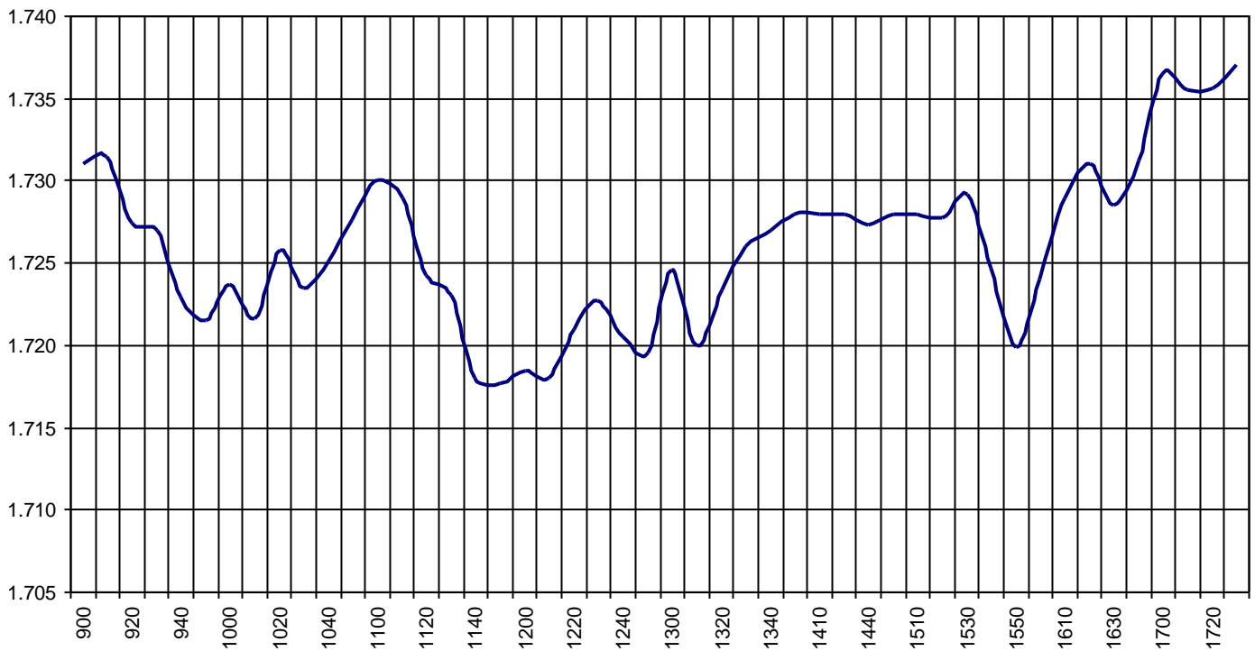
Valor medio del índice IBEX MAB® 15 cada 10' (Index Average every 10')