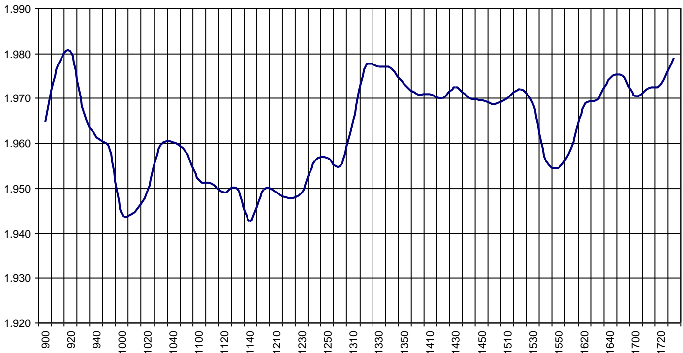
Valor medio del índice IBEX MAB® 15 cada 10' (Index Average every 10')