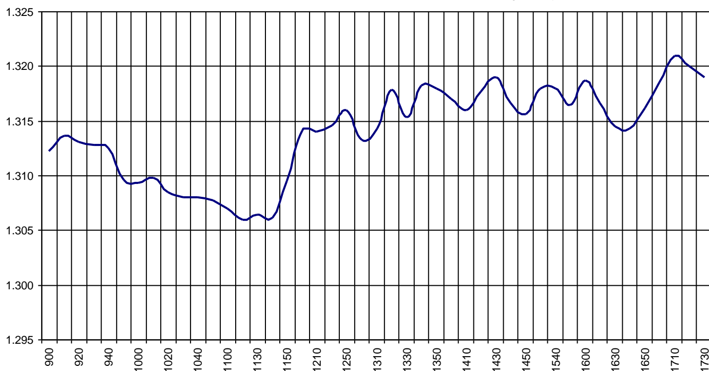
Valor medio del índice IBEX MAB® All Share cada 10' (Index Average every 10')