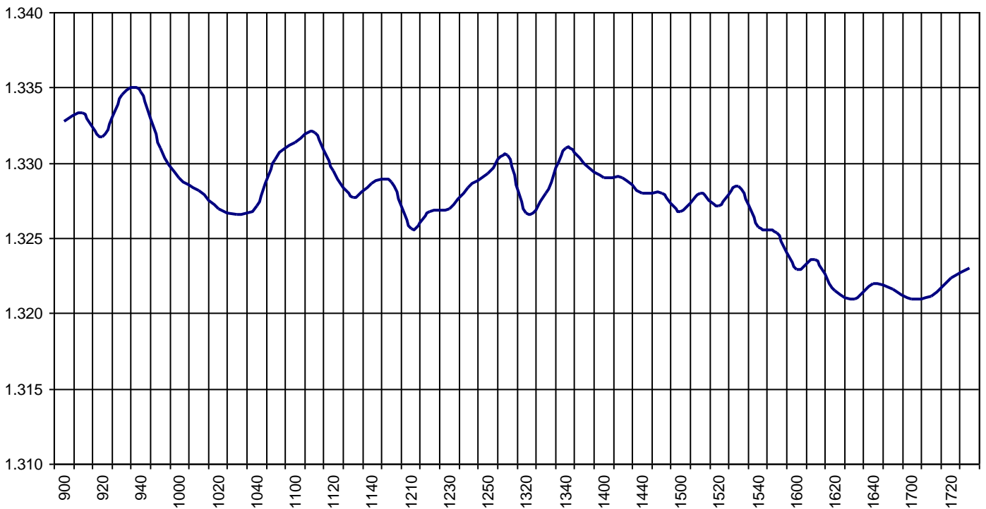
Valor medio del índice IBEX MAB® All Share cada 10' (Index Average every 10')