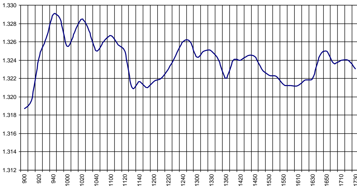
Valor medio del índice IBEX MAB® All Share cada 10' (Index Average every 10')