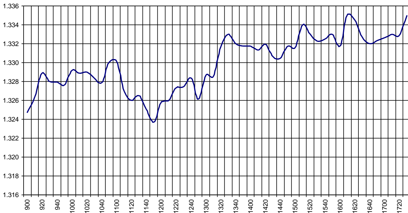
Valor medio del índice IBEX MAB® All Share cada 10' (Index Average every 10')