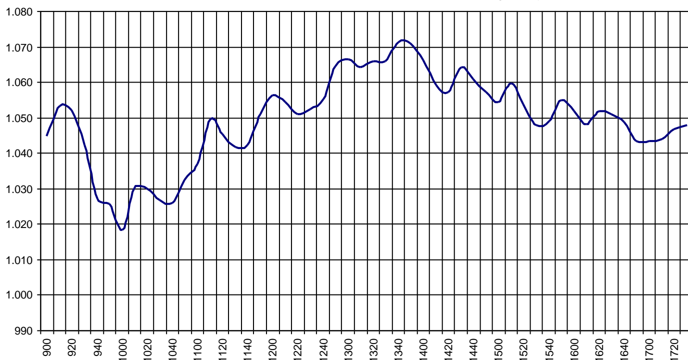
Valor medio del índice IBEX MAB® All Share cada 10' (Index Average every 10')