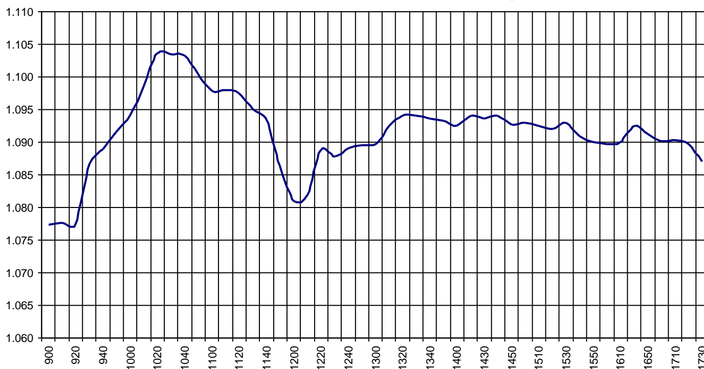
Valor medio del índice IBEX MAB® All Share cada 10' (Index Average every 10')