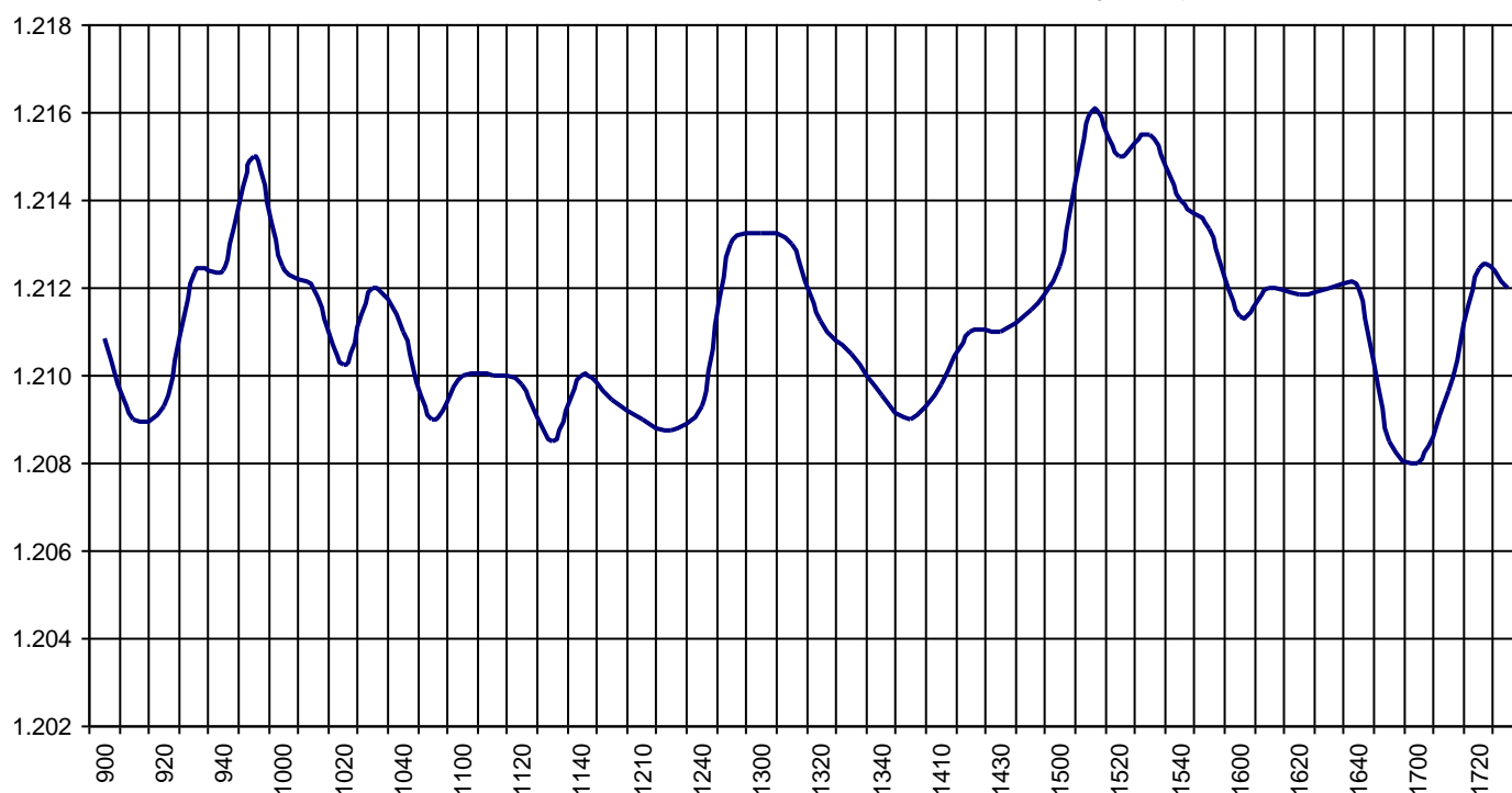
Valor medio del índice IBEX MAB® All Share cada 10' (Index Average every 10')