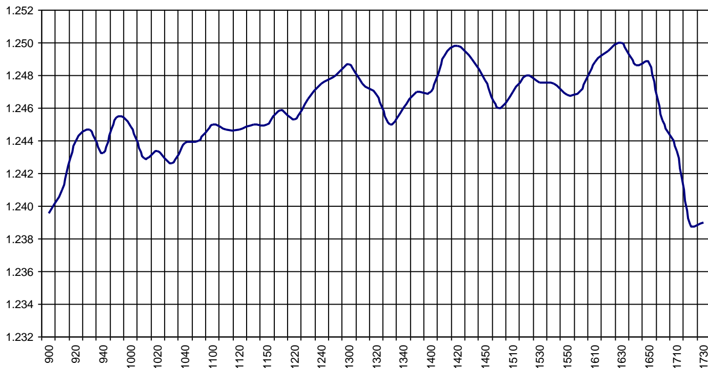
Valor medio del índice IBEX MAB® All Share cada 10' (Index Average every 10')