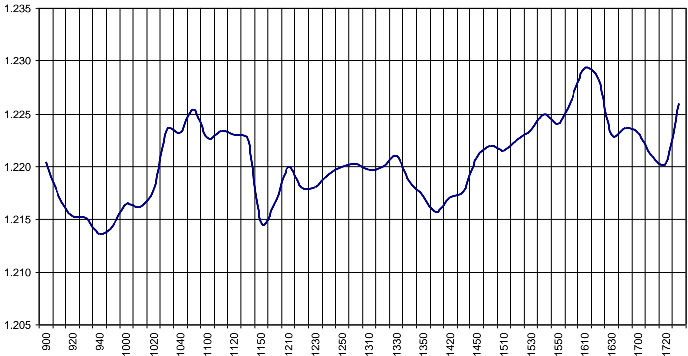
Valor medio del índice IBEX MAB® All Share cada 10' (Index Average every 10')