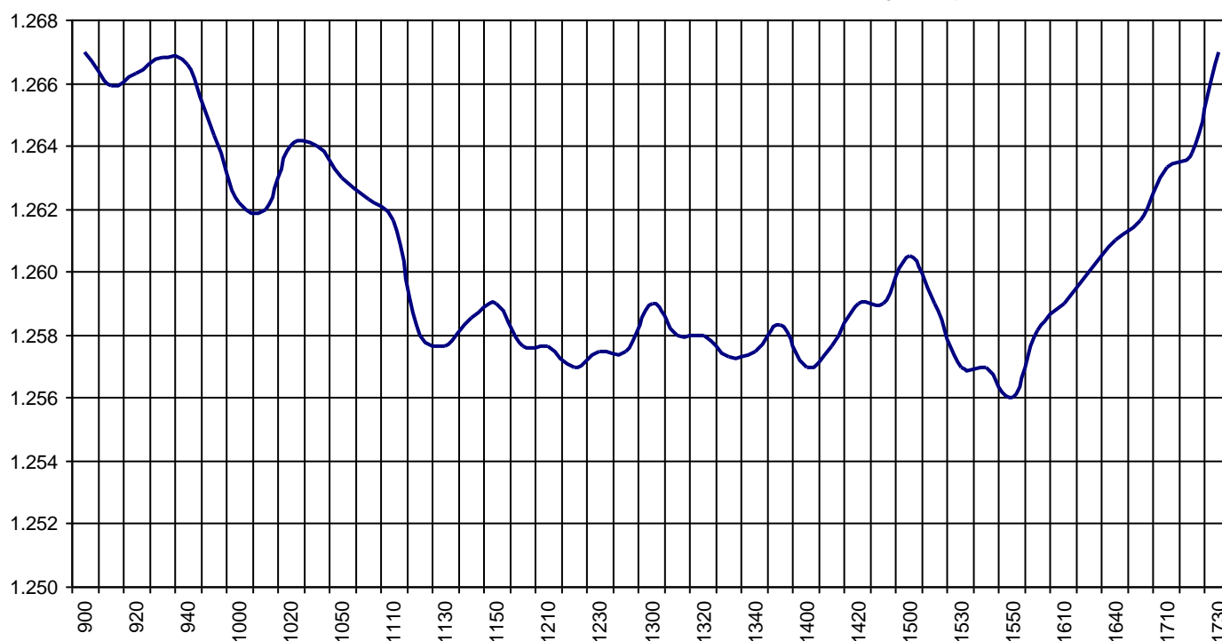
Valor medio del índice IBEX MAB® All Share cada 10' (Index Average every 10')