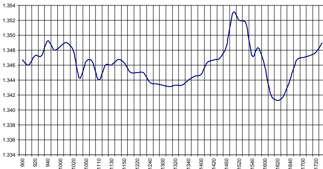
Valor medio del índice IBEX MAB® All Share cada 10' (Index Average every 10')