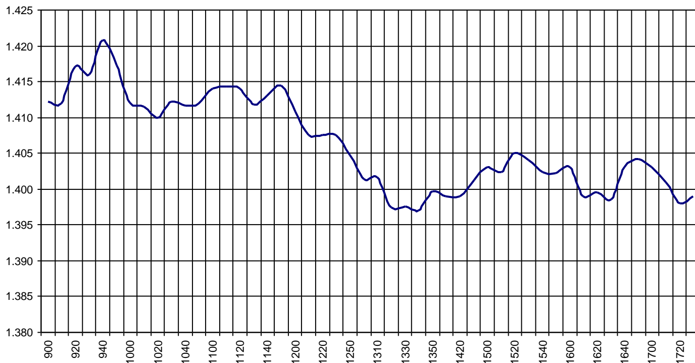
Valor medio del índice IBEX MAB® All Share cada 10' (Index Average every 10')