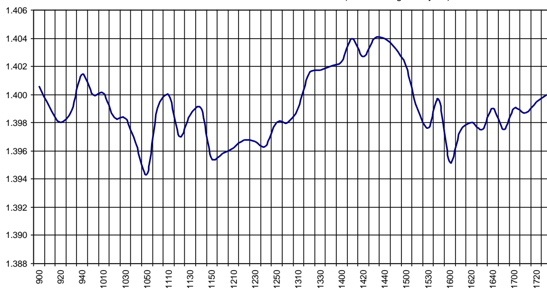
Valor medio del índice IBEX MAB® All Share cada 10' (Index Average every 10')