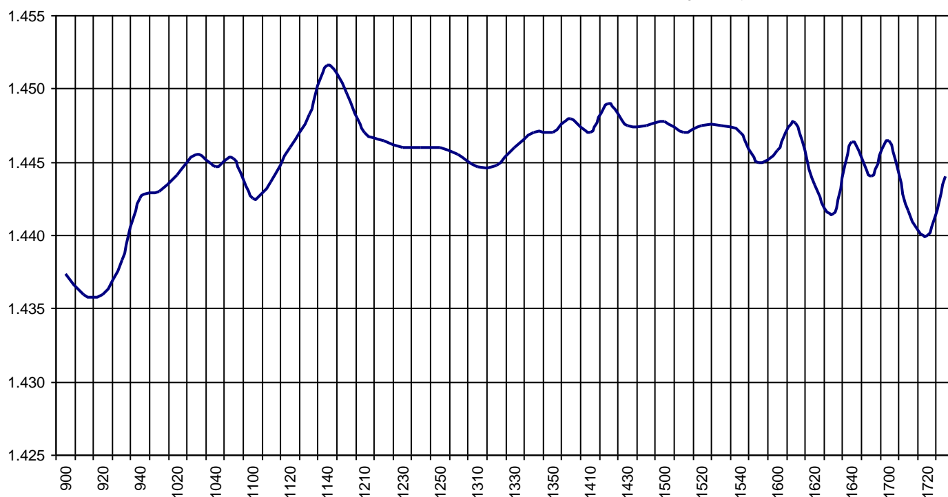
Valor medio del índice IBEX MAB® All Share cada 10' (Index Average every 10')