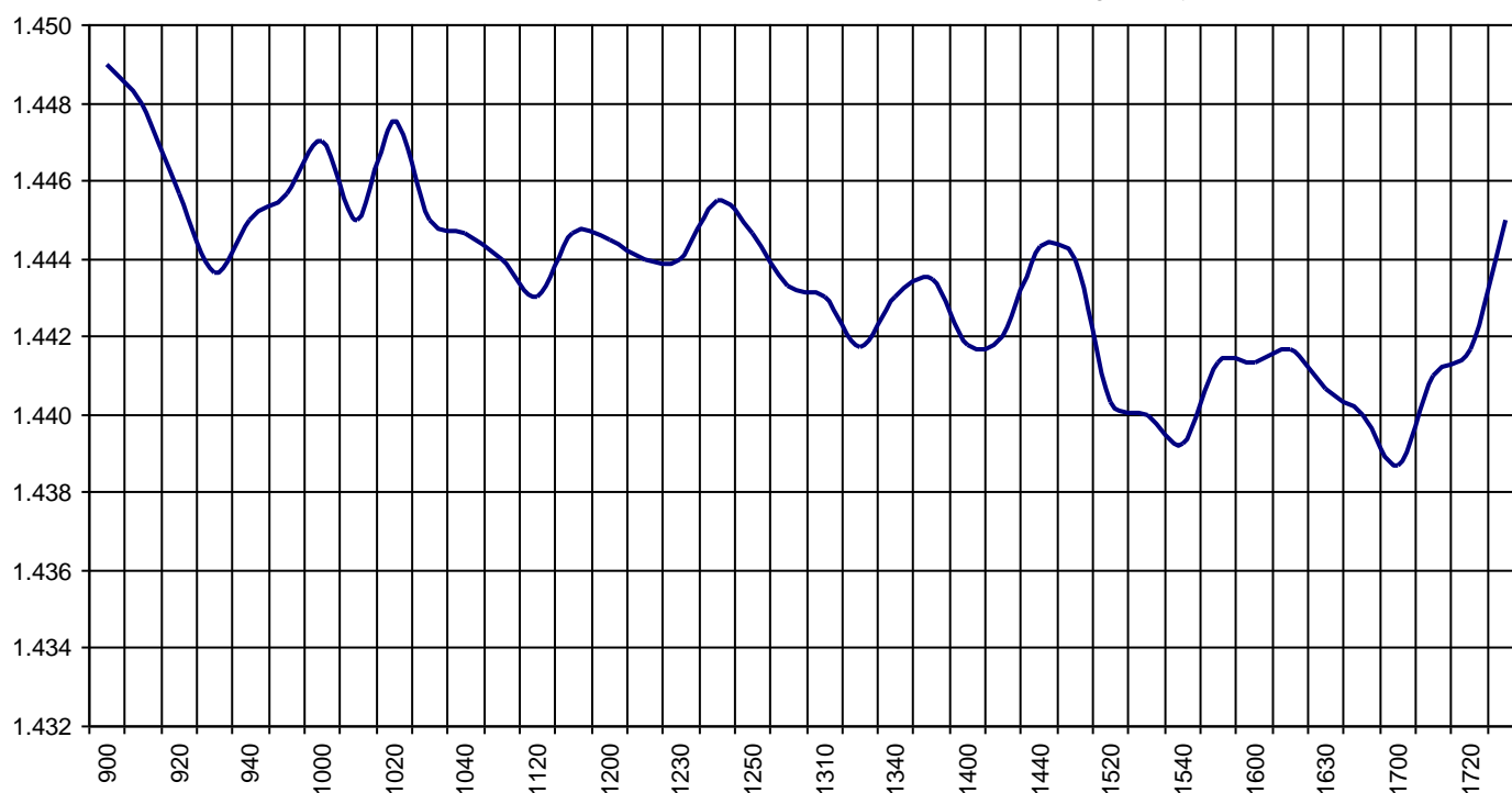
Valor medio del índice IBEX MAB® All Share cada 10' (Index Average every 10')