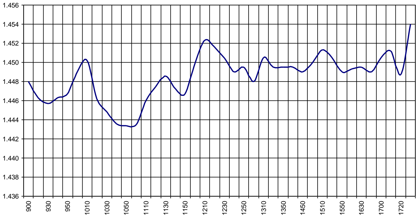
Valor medio del índice IBEX MAB® All Share cada 10' (Index Average every 10')