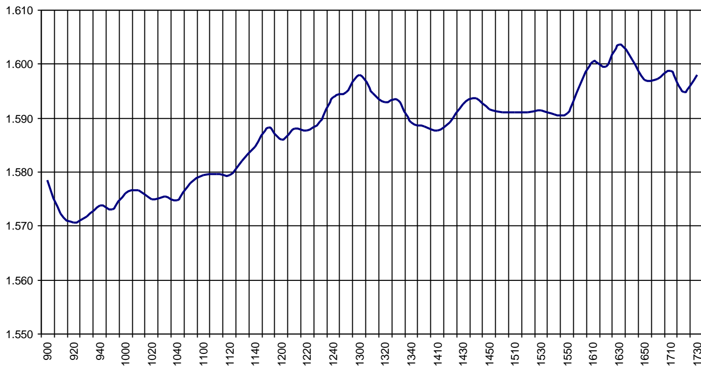
Valor medio del índice IBEX MAB® All Share cada 10' (Index Average every 10')